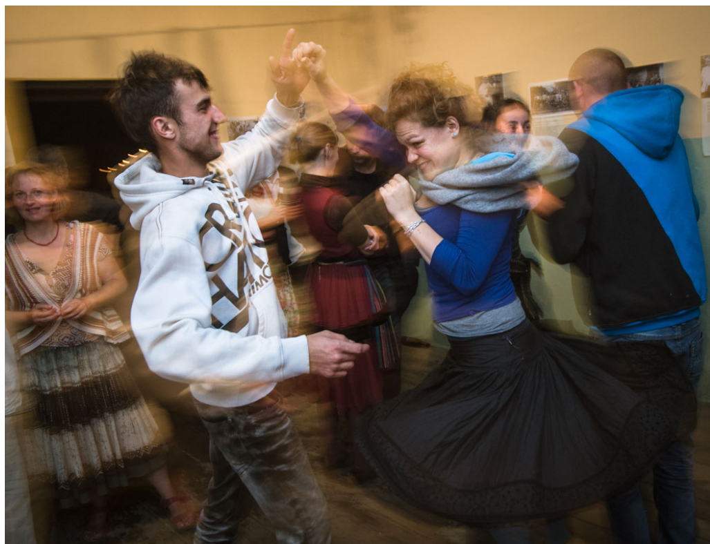
Mazurka dance party in Gafki Rusinowskie

Read more about Mazurka and Polish traditional dance